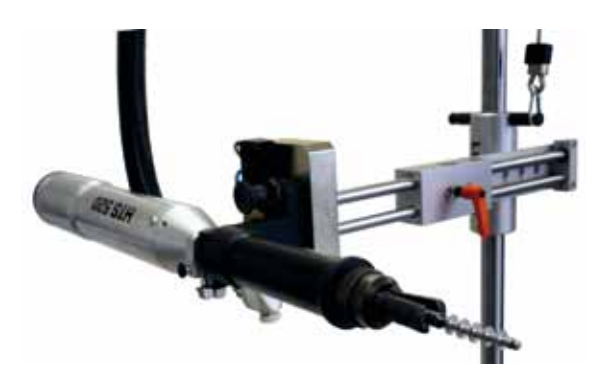
new reloading position