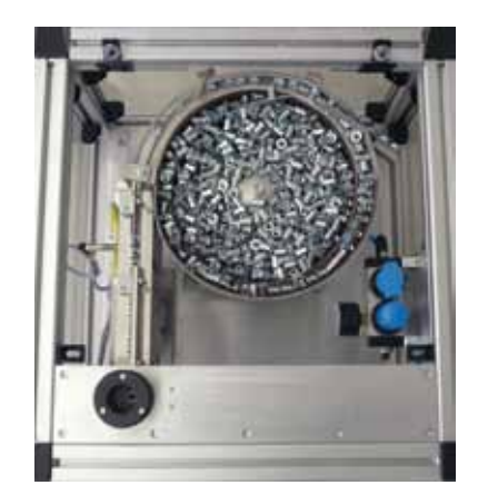
Swivelling conveyor for sorting and separating