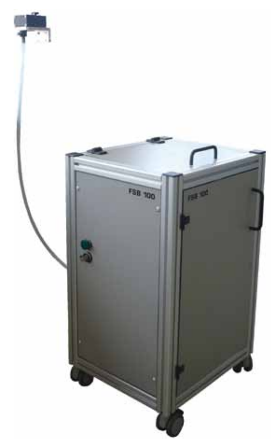
Rivet presenter FSB 100

Dimensions: 480 \times 400 \times 985 \text{ mm} (B x D x H) Lockable casters