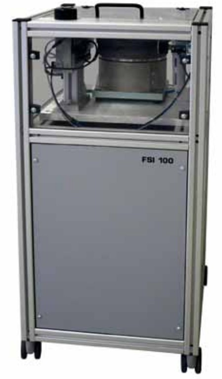
Rivet presenter FSI 100

Dimensions: 480 \times 400 \times 985 \text{ mm} (B \times D \times H) Lockable casters