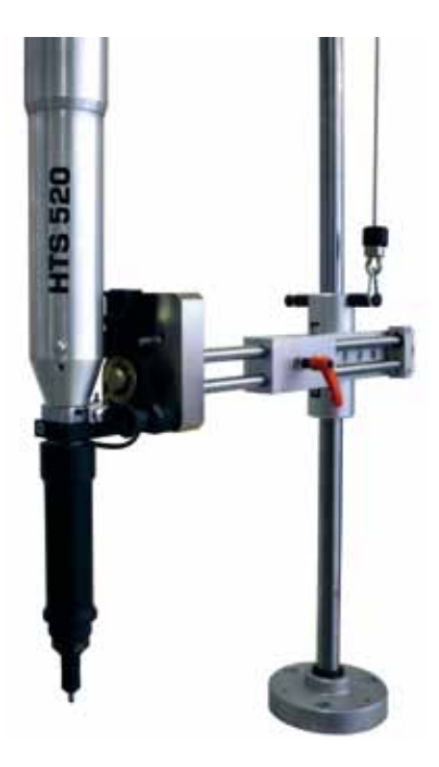
old reloading position and rivet position