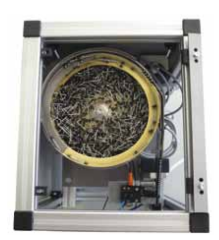
Swivelling conveyor for sorting and separating