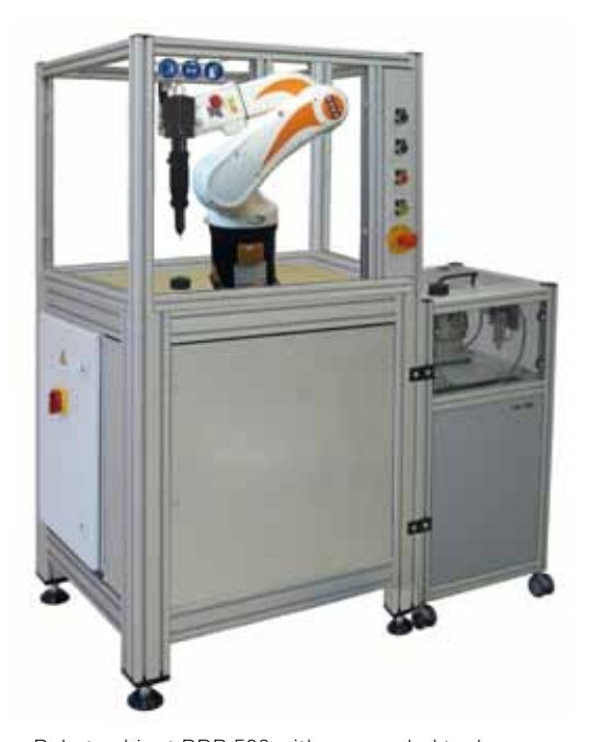
Robot cabinet RRB 500 with suspended tool HTB 500 and rivet presenter FSB 100